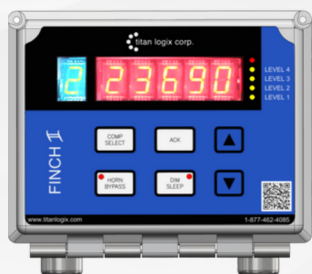
ORIGINAL FINCH II