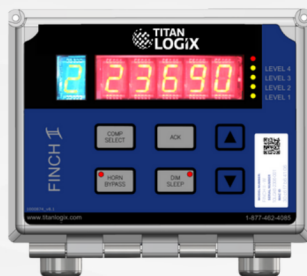
THE NEW FINCH II-W